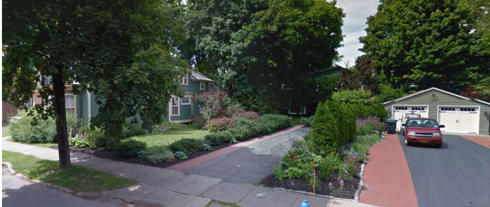
165 Spring Street - Existing Garage View Facing North