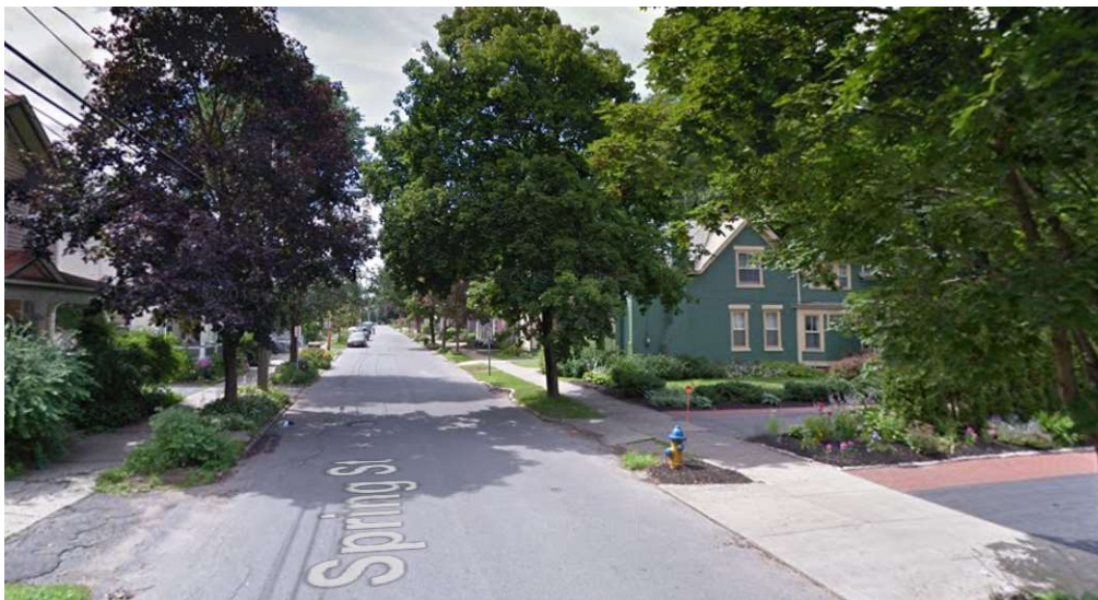
Facing West – Spring Street