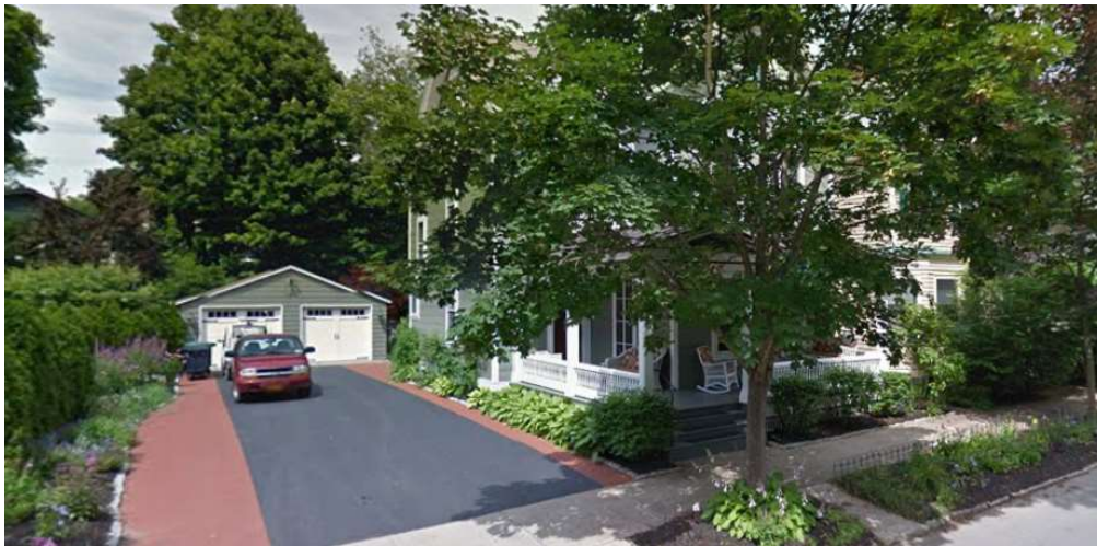
165 Spring Street -Existing Garage and Existing Residence – Facing North East