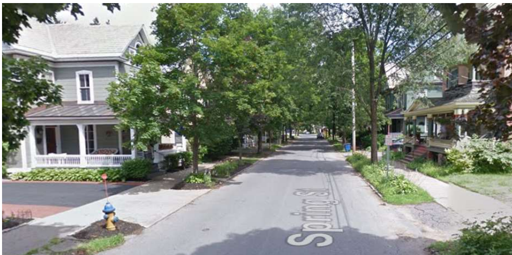
Existing Residence – Facing East on Spring Street