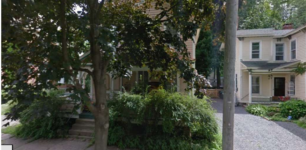
Facing South – Across the Street